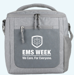
▲ EMS302 20-CAN COOLER minimum order: 20 pieces