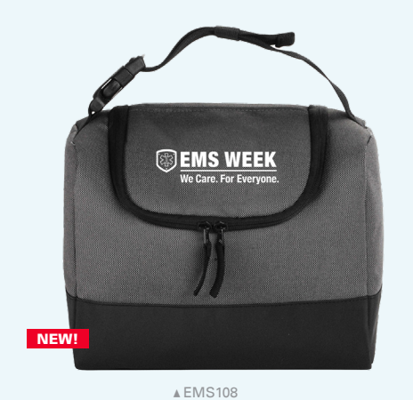
TECH COOLER BAG $16.99