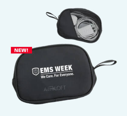
AEROLOFT™TECH ORGANIZER POUCH $8.99