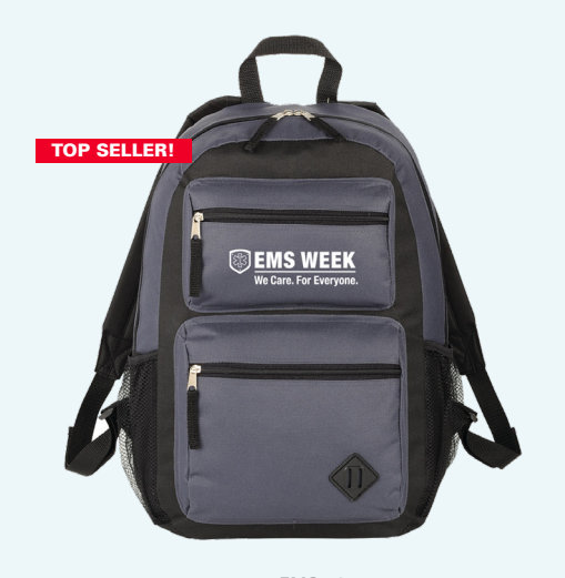
DOUBLE POCKET BACKPACK $19.99