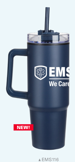
30 OZ. TUMBLER W/ STRAW $13.99