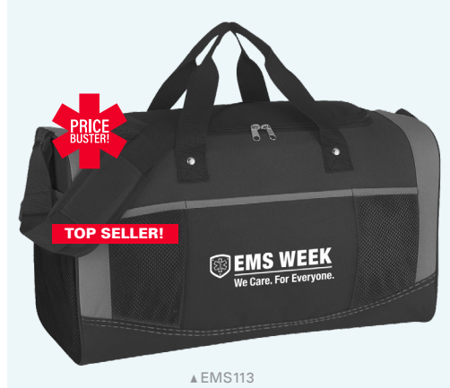
WEEKEND DUFFEL $23.99