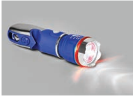
Flashlight/Emergency Tool, ENG30 $20.49