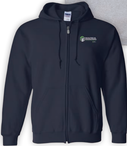
Full-Zip Hoodie, ENG10 $47.99