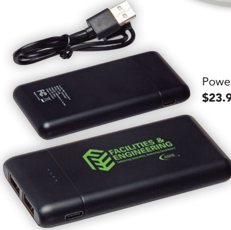
Power Bank, ENG23 $23.99