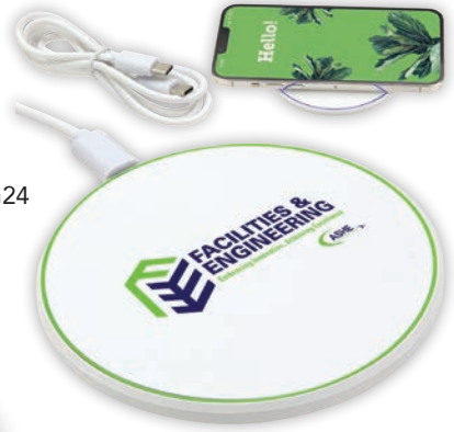
15W Wireless Charging Pad, ENG24 $22.99