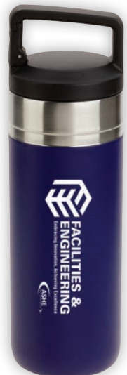
20 oz Vacuum Insulated Bottle w/ Carabiner Lid, ENG21 $22.99