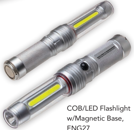
COB/LED Flashlight w/Magnetic Base, ENG27 $18.99