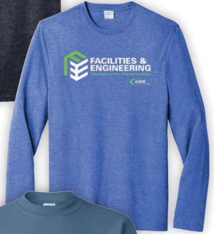
Tri-Blend Long Sleeve Unisex Tee, ENG08 $19.99