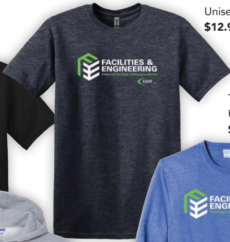
Unisex Tee, ENG06 $12.99