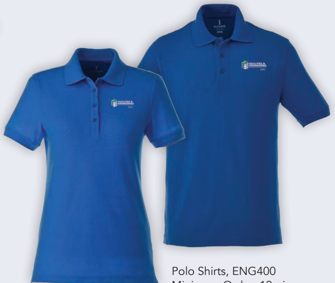
Polo Shirts, ENG400 Minimum Order: 12 pieces Starting at $35.99