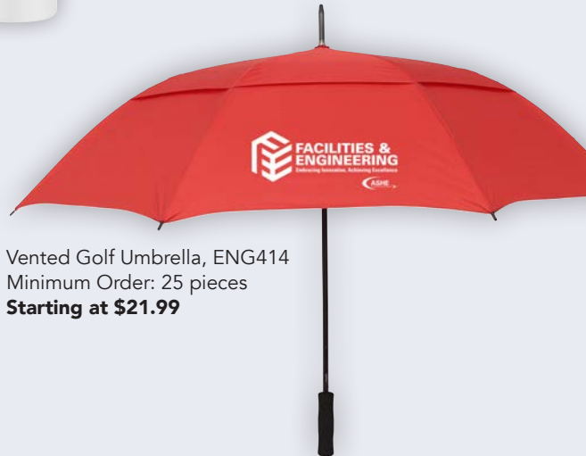
Vented Golf Umbrella, ENG414 Minimum Order: 25 pieces Starting at $21.99