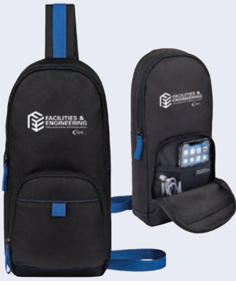
Sling Bag, ENG406 Minimum Order: 25 pieces Starting at $17.99