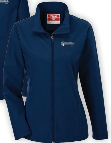
Soft Shell Jacket, ENG12 $74.99