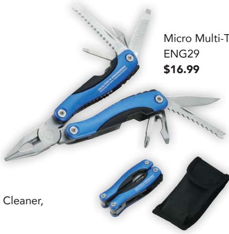
Micro Multi-Tool, ENG29 $16.99