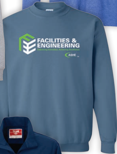
Crewneck Unisex Sweatshirt, ENG11 $29.99