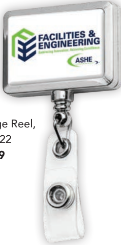
Badge Reel, ENG22 $4.49