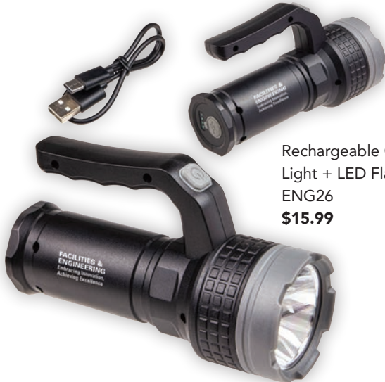
Rechargeable COB Work Light + LED Flashlight, ENG26 $15.99