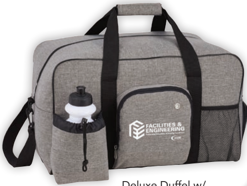
Deluxe Duffel w/ Water Bottle, ENG17 $29.99