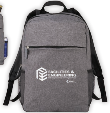
Computer Backpack, ENG18 $23.99