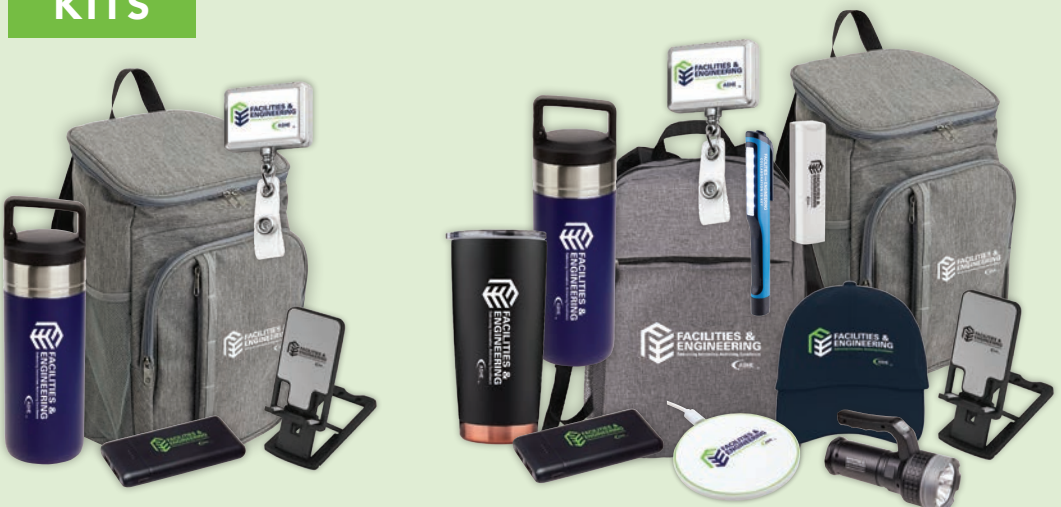
Mini Value Kit, ENG100 $83.99