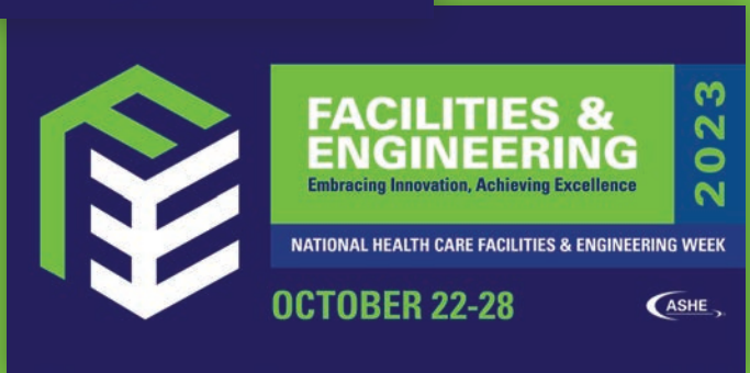
Banner, ENG02 $79.95