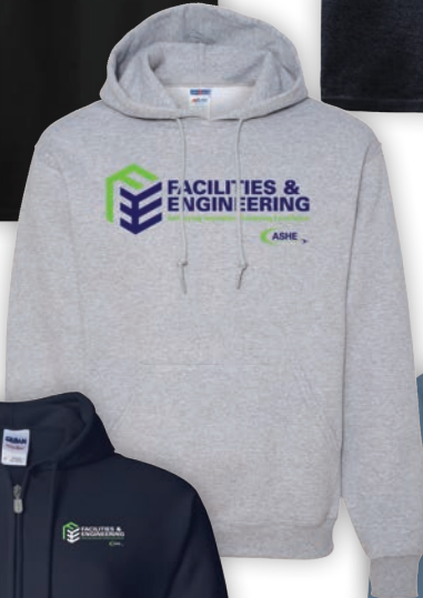
Hooded Sweatshirt, ENG09 $34.99