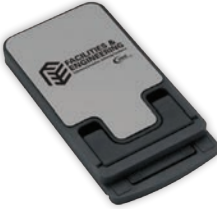
Foldable Media Stand, ENG25 $5.99