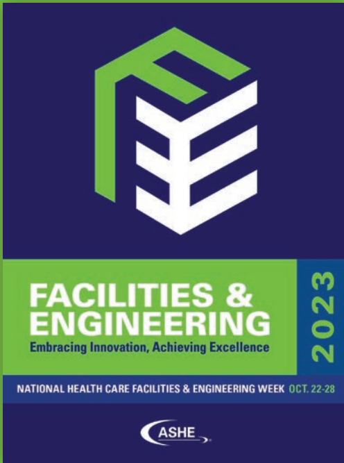
Poster, ENG01 $4.99