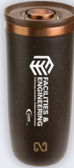
NAYAD® 16 oz. Tumbler, ENG410 Minimum Order: 25 pieces Starting at $25.99