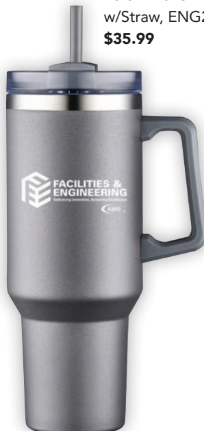
40 oz. Travel Mug w/Straw, ENG20 $35.99