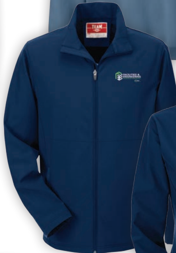
Adult Lightweight Jacket, ENG13 $49.99