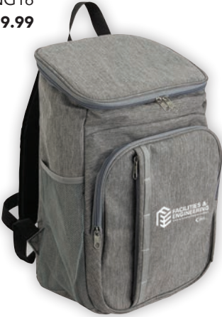
Cooler Backpack, ENG16 $29.99