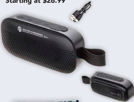
Water Resistant Speaker, ENG417 Minimum Order: 15 pieces Starting at $26.99