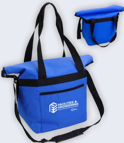
Waterproof Cooler Bag, ENG401 Minimum Order: 30 pieces Starting at $24.99