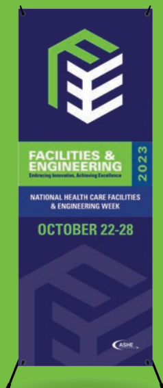
Vinyl Banner with X-Stand, ENG04 $109.95