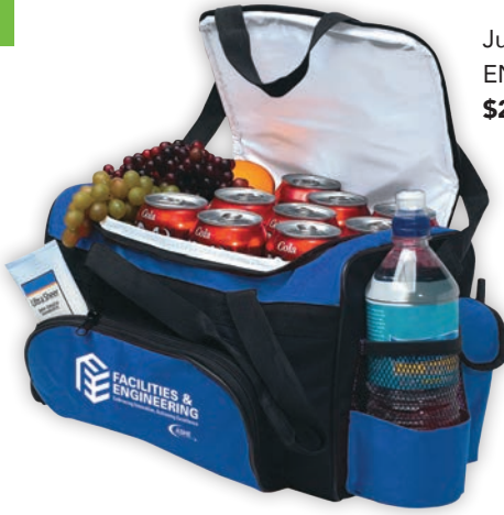
Jumbo Cooler, ENG15 $21.99