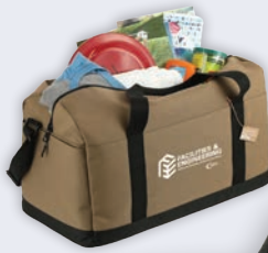
Recycled Utility Duffel, ENG405 Minimum Order: 12 pieces Starting at $74.99