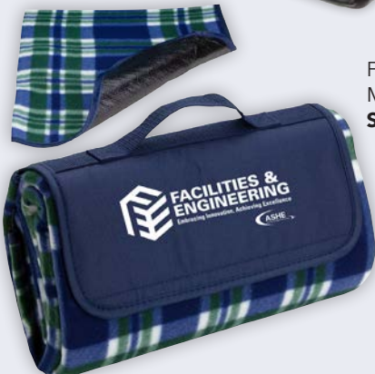
Fleece Blanket, ENG416 Minimum Order: 25 pieces Starting at $19.99