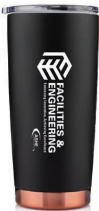
Vacuum Insulated Tumbler, ENG19 $23.99