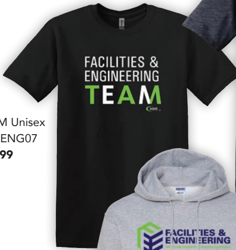
TEAM Unisex Tee, ENG07 $14.99