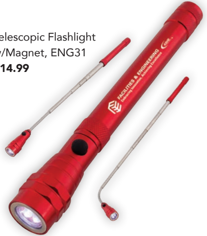
Telescopic Flashlight w/Magnet, ENG31 $14.99