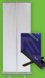
Retractable Banner, ENG03 $159.99