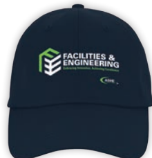
Ballcap, ENG05 $14.99