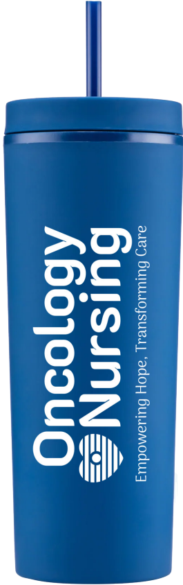
▲ ON114 SLIQUE TUMBLER $13.49