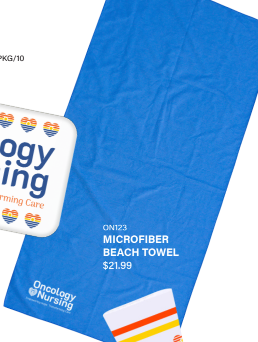
ON123 MICROFIBER BEACH TOWEL $21.99