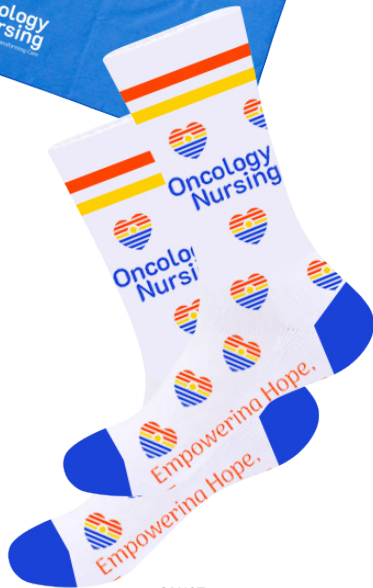
▲ ON107 CREW SOCKS $8.49