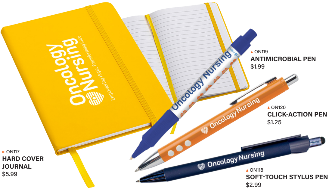
▶ ON117 HARD COVER JOURNAL $5.99