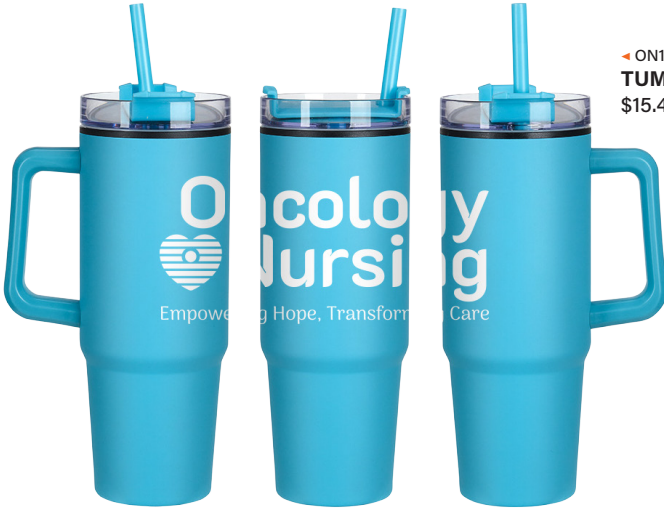
◀ ON115 TUMBLER W/ STRAW $15.49