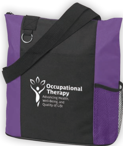
Zip-Up Tote, OT112 $9.99