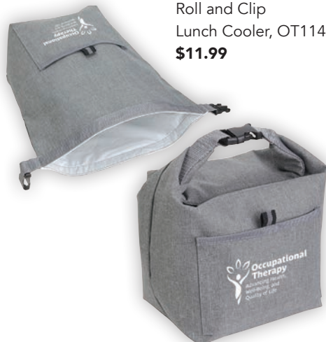
Roll and Clip Lunch Cooler, OT114 $11.99