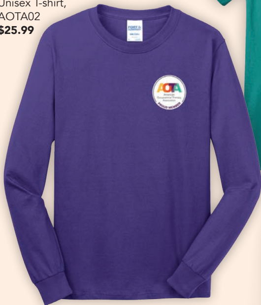
AOTA Long Sleeve Unisex T-shirt, AOTA02 $25.99