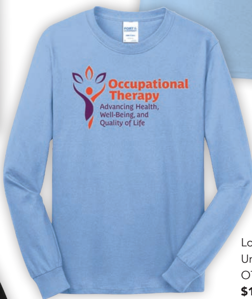
Long Sleeve Unisex T-shirt, OT106 $19.99