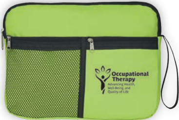
Multi-Purpose Carryall, OT115 $7.99