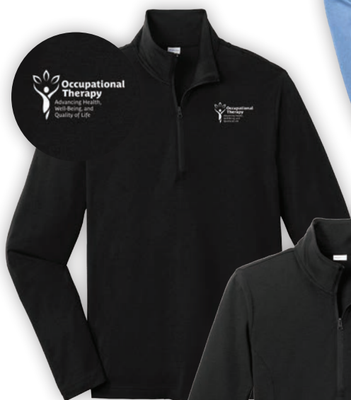
1/4-Zip Pullover, OT107 $39.99