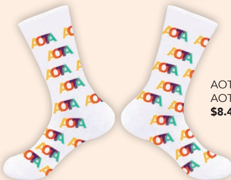
AOTA Crew Socks, AOTA05 $8.49