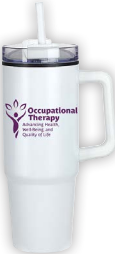
30 oz. Tumbler w/Straw, OT109 $15.49