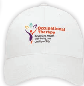
Pro-Lite Deluxe Cap, OT108 $14.99