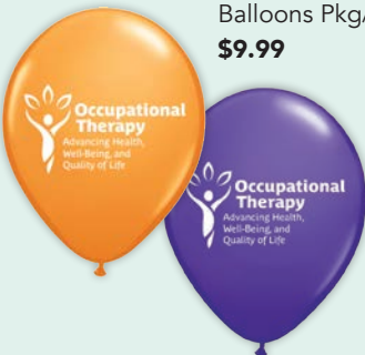
Balloons Pkg/20, OT103 $9.99