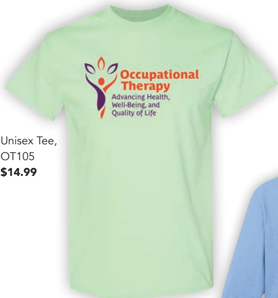
Unisex Tee, OT105 $14.99