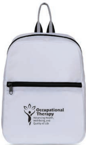
Mini Backpack, OT111 $13.99