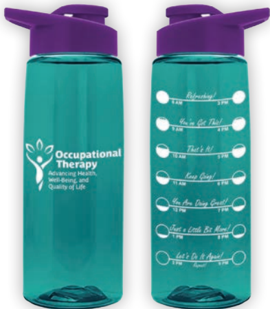
Stay Hydrated Bottle, OT110 $8.99