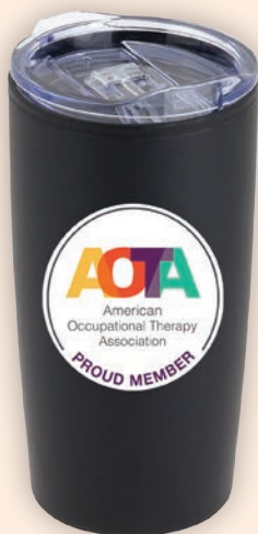
AOTA Tumbler, AOTA03 $14.99