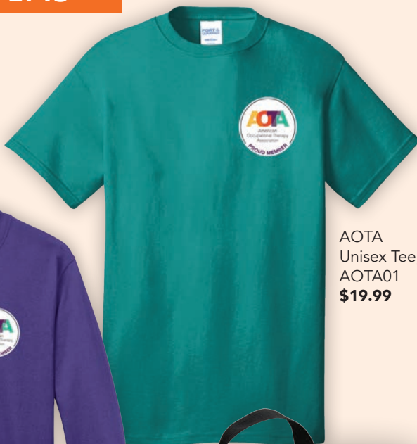
AOTA Unisex Tee, AOTA01 $19.99