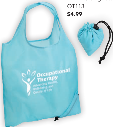
RPET Folding Tote Bag, OT113 $4.99