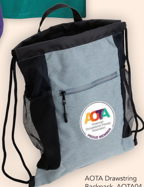
AOTA Drawstring Backpack, AOTA04 $15.99