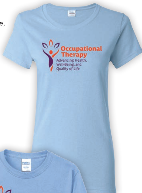
Ladies Tee, OT104 $15.99