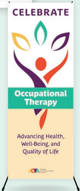
X-Stand Banner, OT101 Banner w/ Stand: $114.95 Banner Only: $59.99