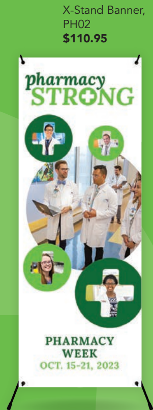
X-stand Banner, PH02 $110.95