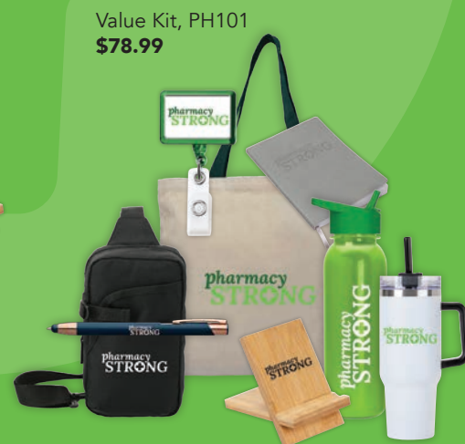
Value Kit, PH101 $78.99