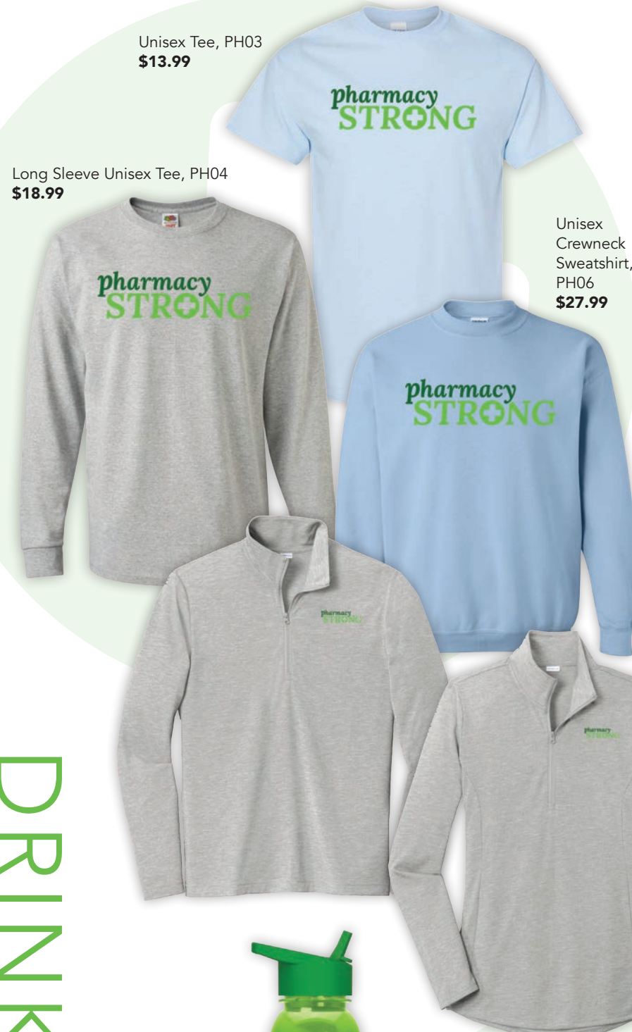
Unisex Tee, PH03 $13.99