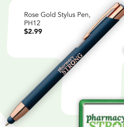
Rose Gold Stylus Pen, PH12 $2.99