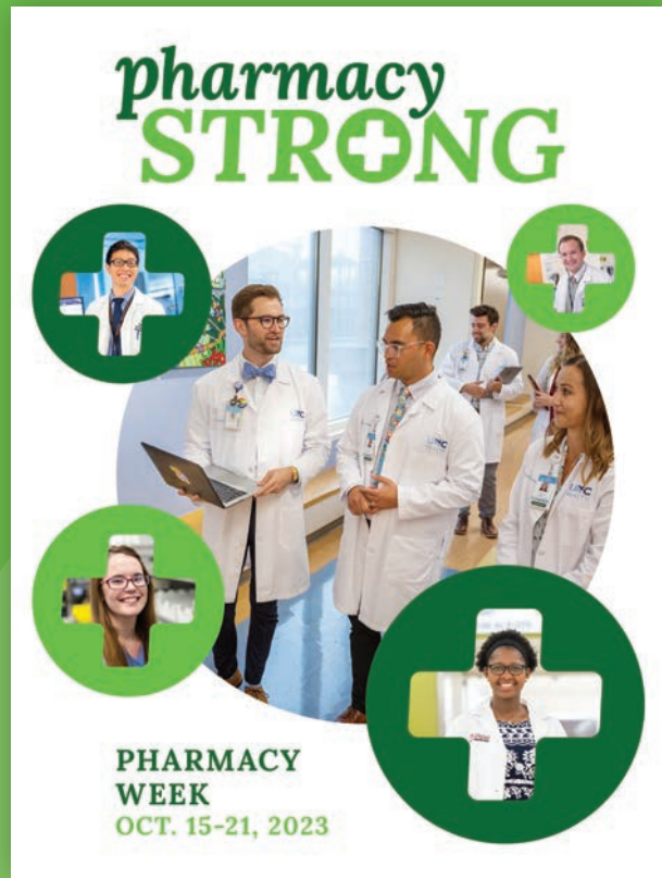
Poster, PH01 $4.99