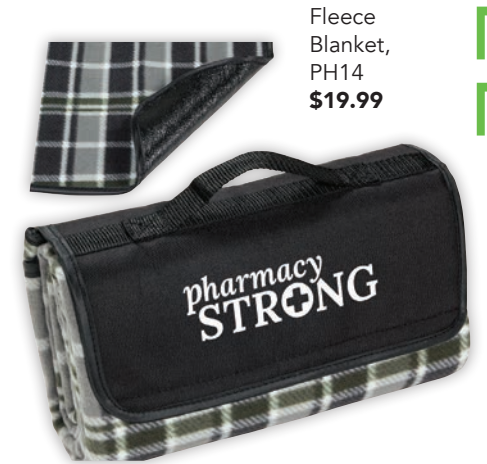
Fleece Blanket, PH14 $19.99