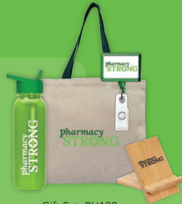
Gift Set, PH100 $28.99