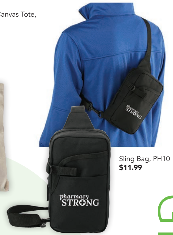
Sling Bag, PH10 $11.99