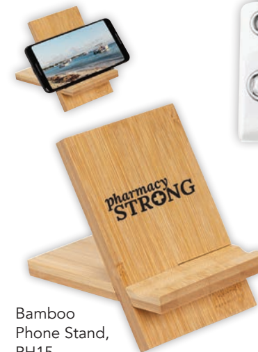
Bamboo Phone Stand, PH15 $5.99