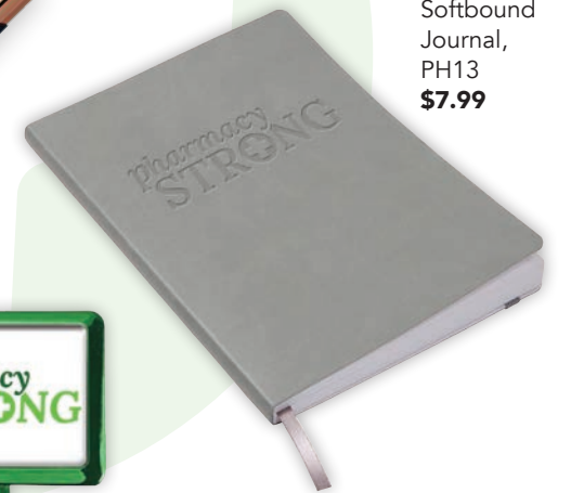
Softbound Journal, PH13 $7.99