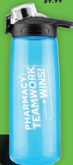
TEAM Flip-Top Measurement Bottle, PH301 $9.99