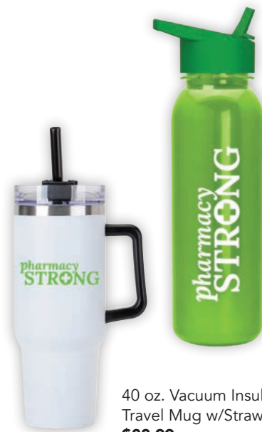
40 oz. Vacuum Insulated Travel Mug w/Straw, PH07 $28.99