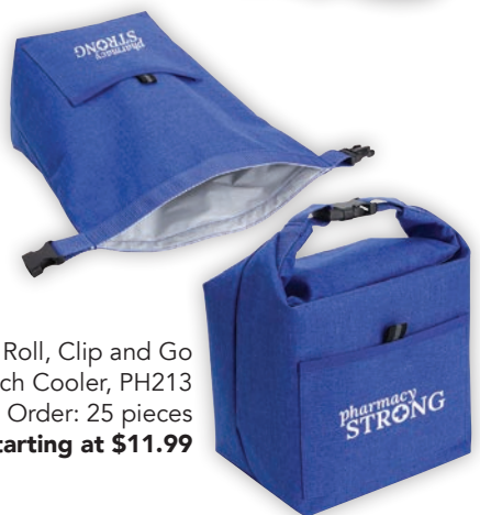
Roll, Clip and Go Lunch Cooler, PH213 Minimum Order: 25 pieces Starting at $11.99

PRSR STD US POSTAGE PAID PALATINE P&DC IL PERMIT 11