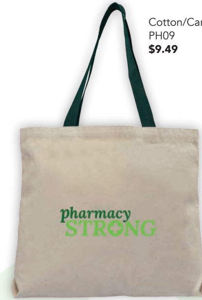
Cotton/Canvas Tote, PH09 $9.49