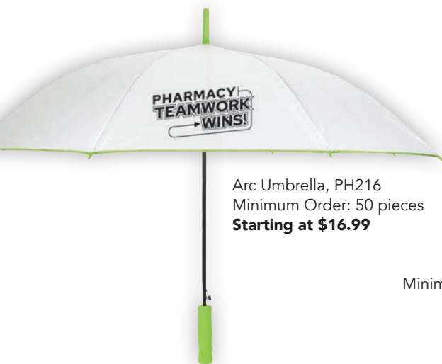
Arc Umbrella, PH216 Minimum Order: 50 pieces Starting at $16.99