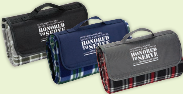
Fleece Blanket, SS118 Minimum Order: 25 pieces $19.99