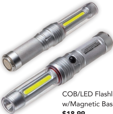
COB/LED Flashlight w/Magnetic Base, SS17 $18.99