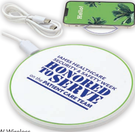
15W Wireless Charging Pad, SS13 $22.99