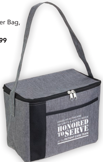
Cooler Bag, SS10 $10.99