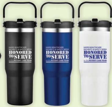
30 oz Vacuum Insulated Tumbler with Flip-Top Spout, SS109 Minimum Order: 25 pieces Starting at $26.99