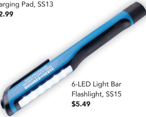
6-LED Light Bar Flashlight, SS15 $5.49