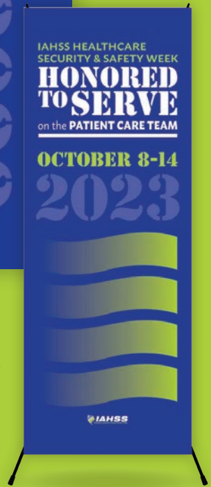
Vinyl Banner with X-Stand, SS03 $109.95