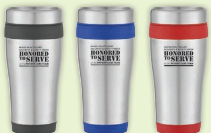
Value Tumbler, SS115 Minimum Order: 48 pieces Starting at $8.49