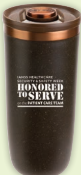
NAYAD® 16 oz. Tumbler, SS114 Minimum Order: 25 pieces Starting at $25.99