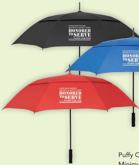
Vented Golf Umbrella, SS116 Minimum Order: 25 pieces Starting at $21.99