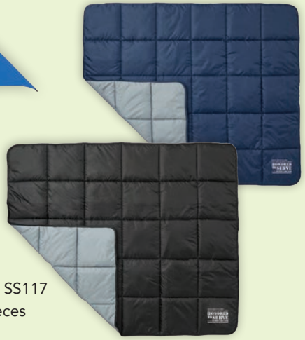
Puffy Outdoor Blanket, SS117 Minimum Order: 30 pieces Starting at $27.99