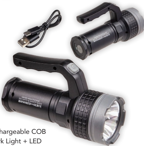
Rechargeable COB Work Light + LED Flashlight, SS16 $15.99