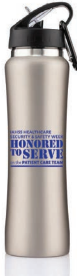
Stainless Water Bottle, SS07 $17.99