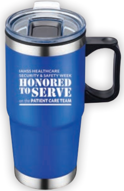
24 oz. Travel Mug, SS06 $16.99