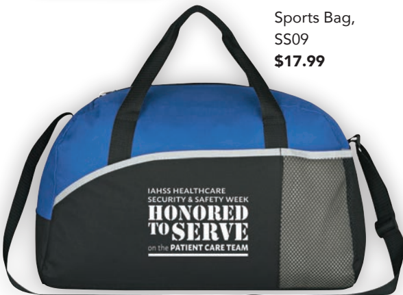
Sports Bag, SS09 $17.99