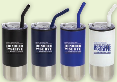
Dual Function Tumbler, SS111 Minimum Order: 25 pieces Starting at $9.99