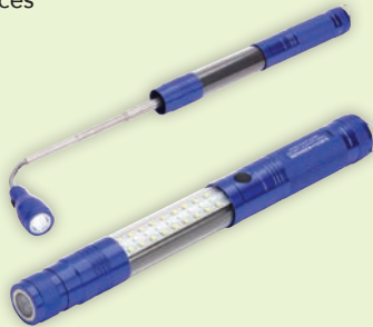
Premium Telescoping Worklight, SS121 Minimum Order: 15 pieces Starting at $20.99