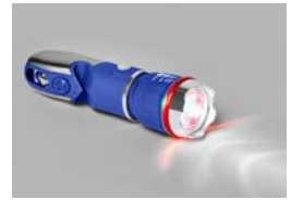
Flashlight/Emergency Tool, SS14 $19.99