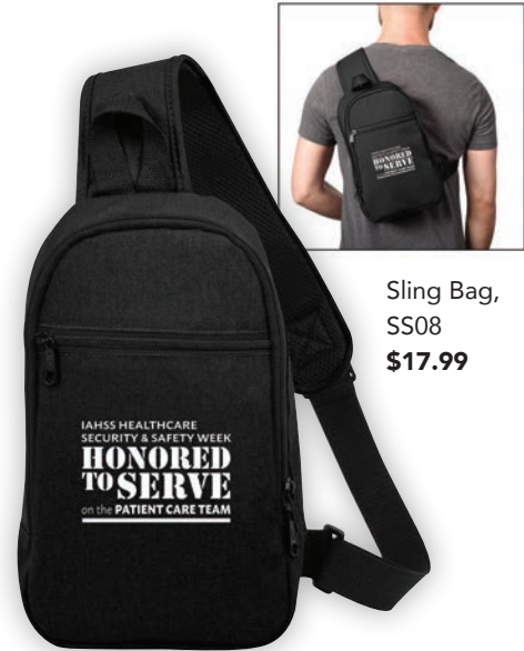
Sling Bag, SS08 $17.99