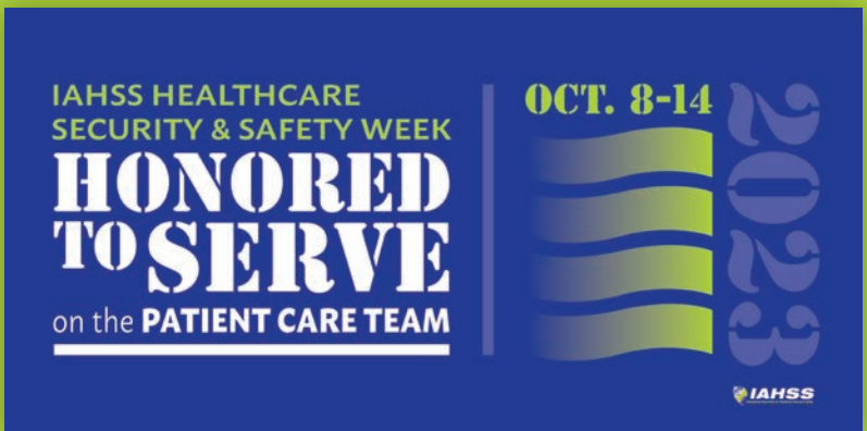
Banner, SS02 $74.95