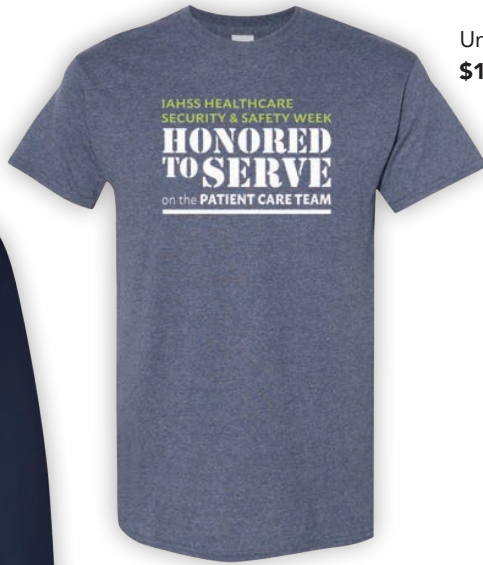
Unisex Tee, SS04 $13.99