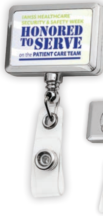
Badge Reel, SS12 $4.29