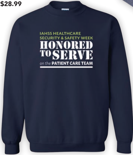
Crewneck Unisex Sweatshirt, SS05 $28.99