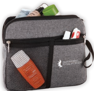
Multi-Purpose Carryall, SW114 $7.99