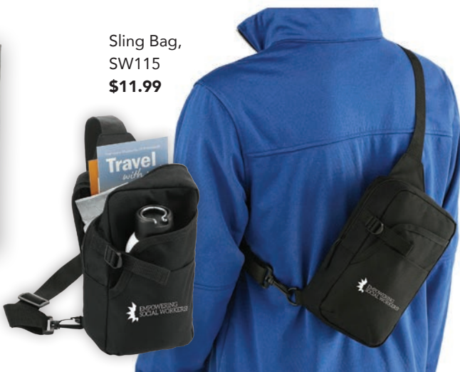
Sling Bag, SW115 $11.99