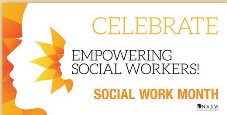
Banner, SW101 $79.95