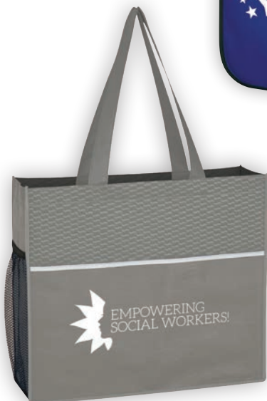
Nonwoven Wave Tote, SW117 $4.49