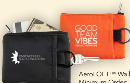
AeroLOFT™ Wallet, SW216 Minimum Order: 50 pieces Starting at $5.99