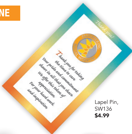
Lapel Pin, SW136 $4.99