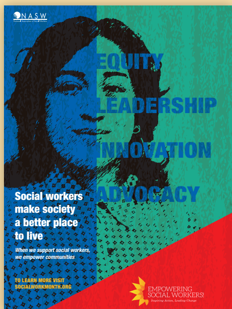
Poster, SW100 $4.99