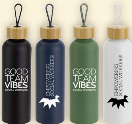
Aluminum Bottle w/ Bamboo Lid, SW207 Minimum Order: 25 pieces Starting at $10.49

Here are examples of additional items at a special price when ordered in bulk quantities. Please go to our website at jimcolemansstore.com/sw to get more product choices and details including price, colors, logo and quantity.