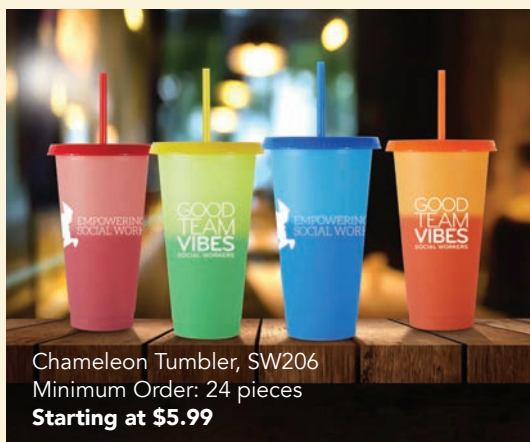
Chameleon Tumbler, SW206 Minimum Order: 24 pieces Starting at $5.99