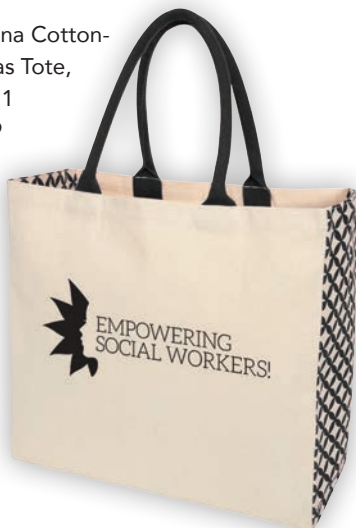
Catalina Cotton- Canvas Tote, SW111 $9.99