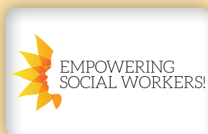
Buttons Pkg/10, SW104 $8.99

X-Stand Vinyl Banner, SW102 Banner w/ Stand: $114.95 Banner Only: $59.99