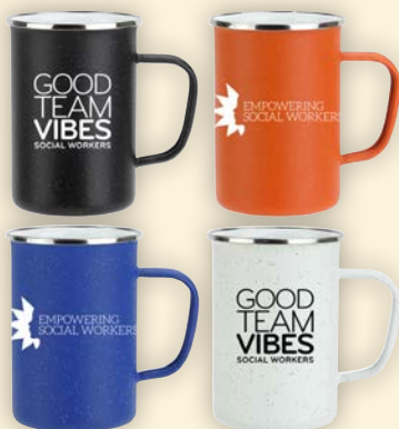
Enamel-Lined Iron Mug, SW202 Minimum Order: 25 pieces $9.99