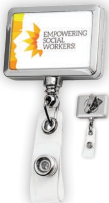
Badge Reel, SW135 $4.29