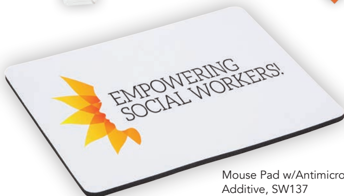
Mouse Pad w/Antimicrobial Additive, SW137 $5.49